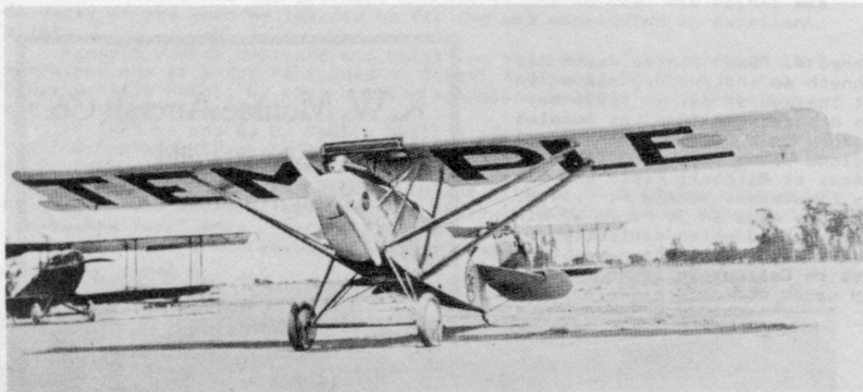
Montee "Silver Mosquito" used Fokker D-7 fuselage, Curtiss K-6 engine and custom built wing. Ship placed 2nd in "On to New York" segment of 1925 International Air Races.